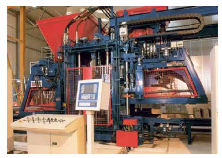
140/100 Besser Big Board Machine.

Whether providing mechanical or electrical troubleshooting assistance, guidance for producing new concrete products or providing advice about concrete mix designs, the Besser