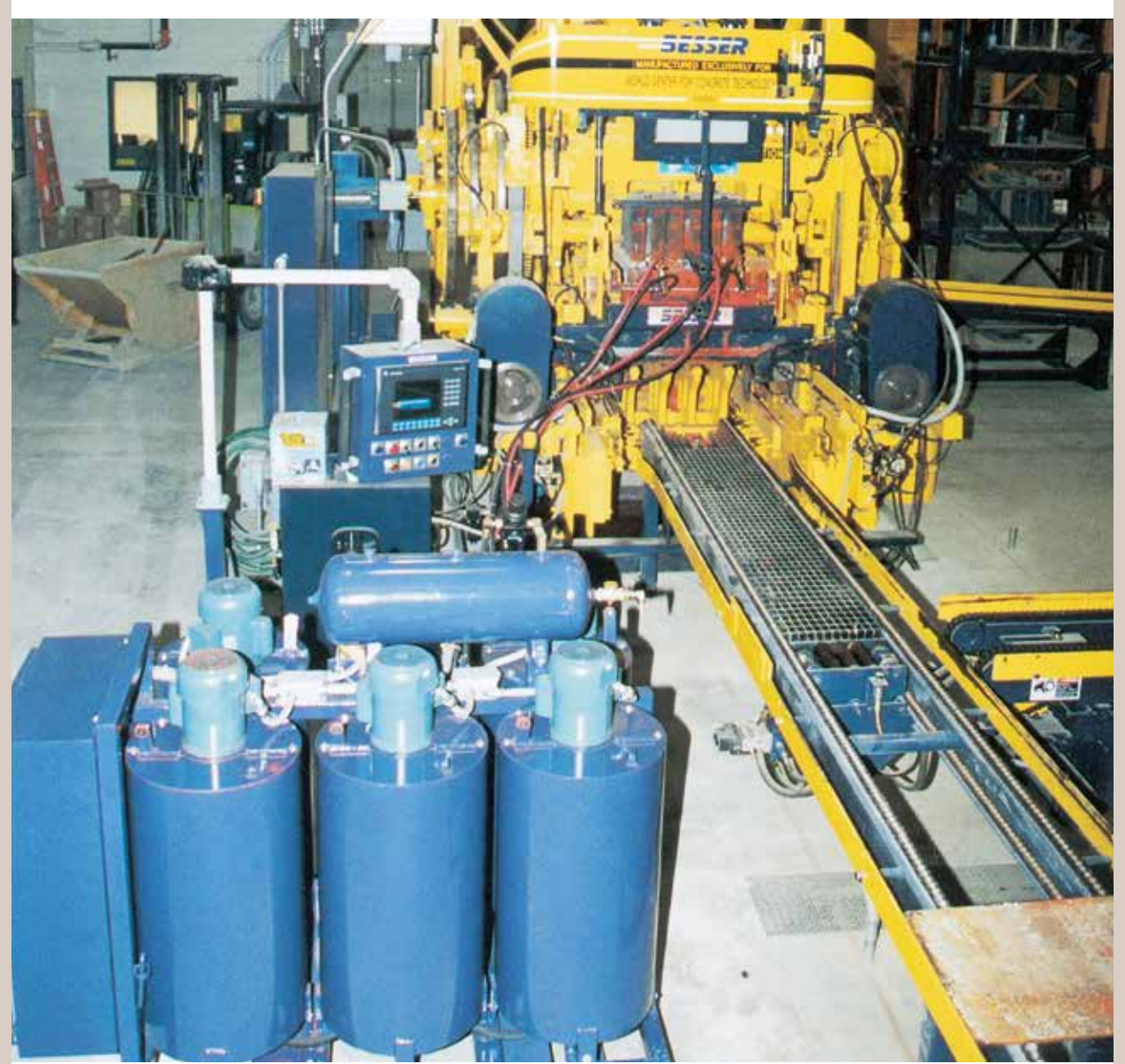
The Founders Spray Machine enhances the appearance of concrete products.

The Founders Spray Machine will add a unique blend of colors and patterns to the face of concrete products. Creating these "value-added" products allows you to tap into new markets and increase profitability.