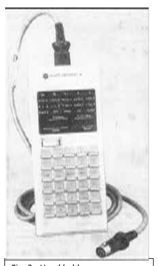
Fig. 3 - Hand held programmer