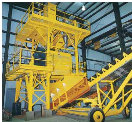
The batch mixer discharges onto a metering conveyor.