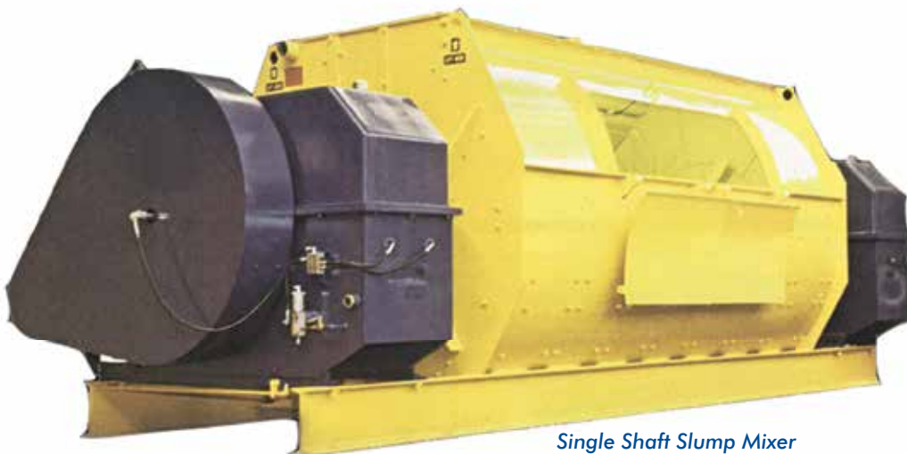
Single Shaft Slump Mixer