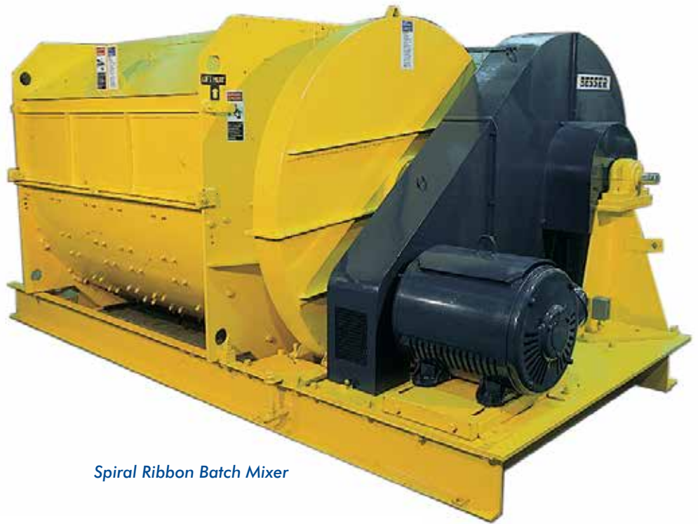
Spiral Ribbon Batch Mixer

Quality is the hallmark of Besser machinery. Highly skilled staff follow the stringent Besser Quality System during the design, manufacture, assembly and testing of each mixer.