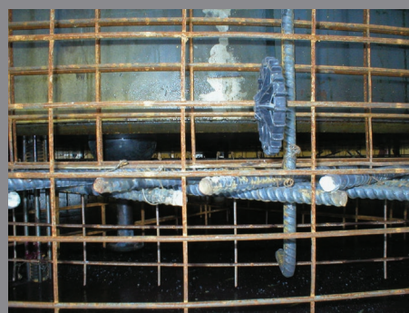
Typical view of the base area showing wire reinforcing, core ties and re-rod

Access ladders and platforms can be located in the core and/or on the jacket for pouring and stripping safety.