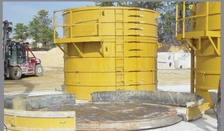
120" x 7'-10" Bottom Down Base form with access ladder and work platform