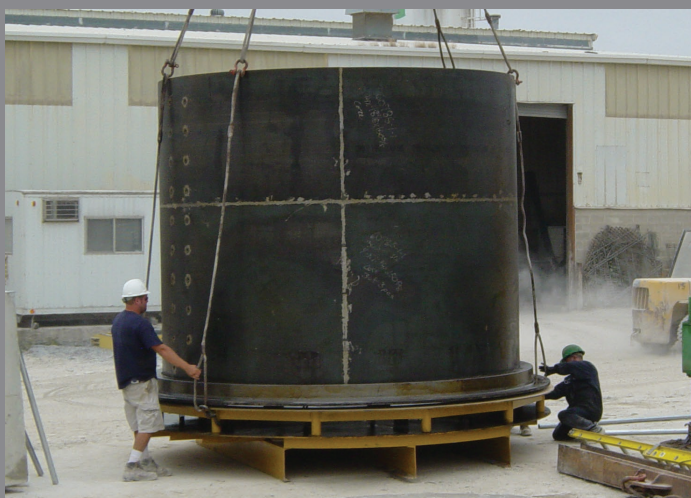
A typical Bottom Down Pour Base Form setup for pouring risers