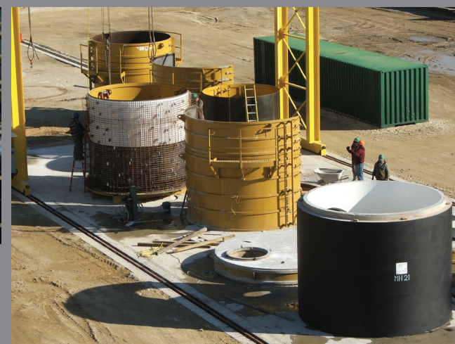
144" x 7'-0" with 3'-0" Extension Bottom Down Base/Riser Form being setup for pouring showing the flexibility of the added Liner