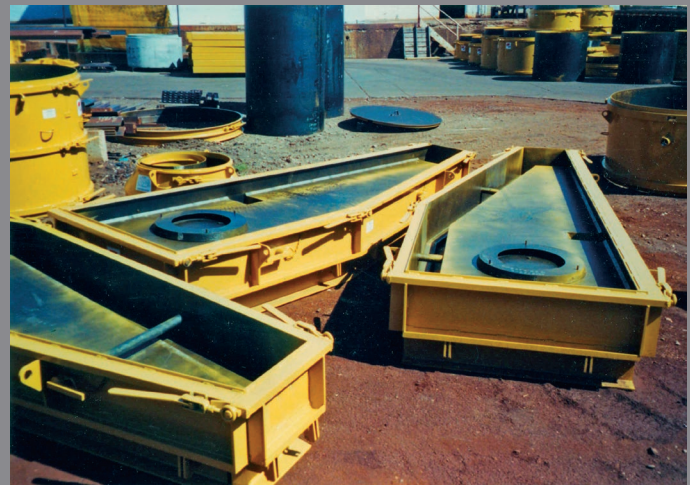
Curb top forms