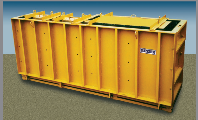
Curb inlet form