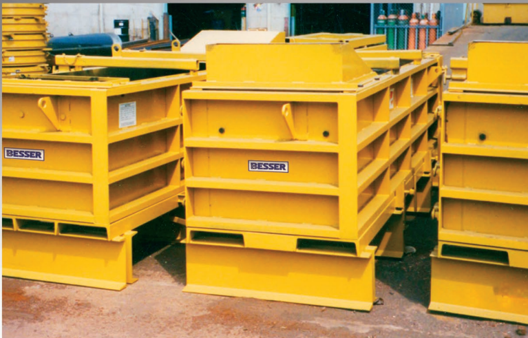
Safety end treatment forms