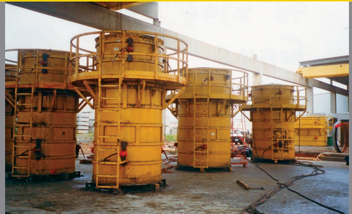
144" (3600 mm) wet cast pipe forms with work platforms