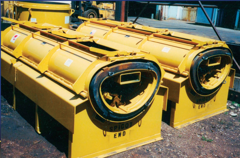
Horizontal-pour arch pipe forms

Custom wet cast forms are a Besser specialty. When your job calls for a unique product size or shape, or if particular state specifications must be met, count on Besser to make a precision form to satisfy your need.