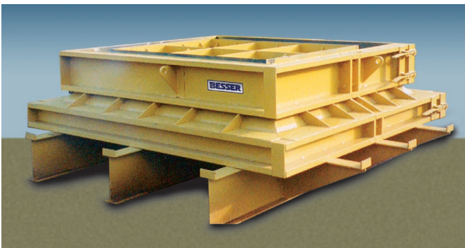
Switchgear pad form

All Besser wet cast forms, whether custom or standard, are backed by knowledge of your local forming requirements and records of your plant's past purchases, aimed at helping you make a properly performing product to satisfy the end user.