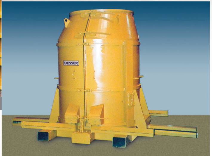
Eccentric cone form with rollers